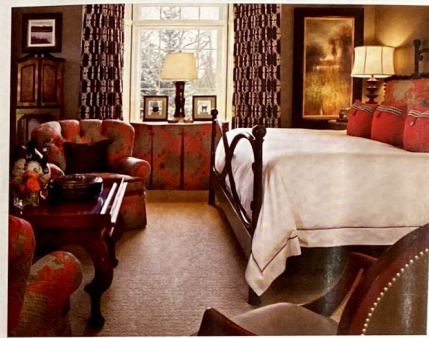
Despite the bold use of color in the master bedroom, the room is serene and comforting. A tailored table skirt on the side of the room turns the focus to the ornate legs on the cocktail table in the center of the room.

THE DETAILS Square Feet: 3,750, Interior Design: Lane Oliver, LEO Interior Design, 303.722.4288, leointeriordesign.com , Painter (not faux finish) Aaron Harding 303.808.5577, For more information on products and furnishings in this home, logon to denverlifemagazine.com and click on Open House.