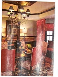
Oliver mixed bold patterns in the dining room while keeping the colors limited. The ceiling medallion is highlighted with a faux finish instead of a standard white finish.

draperies adds color to the wall of windows while keeping it light and airy. Oliver planned the colors and patterns for this room keeping in mind how they would flow into the adjacent rooms for a seamless transformation.